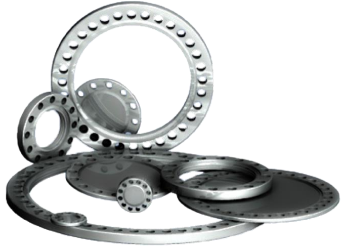
Family of Multi-CF™ Thin Flange Designs