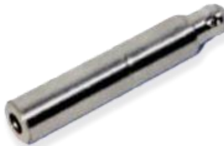
Faraday Cup FC-66