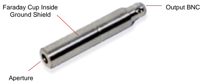
Faraday Cup FC-66

The power input can be calculated by multiplying the beam current times the electron acceleration voltage; for example, 1 mA ( 1 \times 10^{-3} ) at 20 keV ( 20 \times 10^3 ) gives 20 W, which is much too high for continuous measurement.