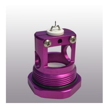
Example of cathode with AEI base secured in transport container base.

To protect the coating on the emission surface during storage and shipping, the cathode is sent in a non-activated (carbonate) form and needs a one-time activation by the user.