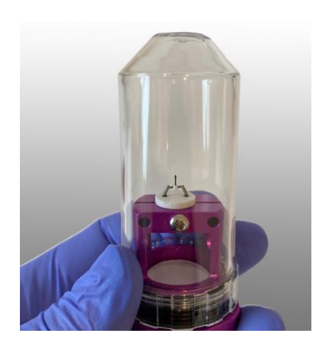
Example of Cathode Transport Container.