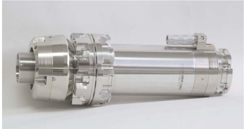
EGF-6104 Electron Flood Gun

The Kimball Physics EGF-6104 Electron Gun, with its matching EGPS-6104 Power Supply, is intended for use in a variety of UHV charging, space physics, vacuum physics, surface physics, and nuclear simulation applications. Maximum flexibility is achieved in a minimum of space; the entire unit mounts through a single standard 2 \frac{3}{4} inch CF port. It is a complete subsystem ready to attach and turn on.