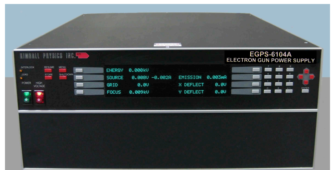
EGPS-6104 Electron Gun Power Supply with FlexPanel controller

An optional LabVIEW™ computer program designed for the EGF-6104 is available for remote computer control and metering. Software is available in two types: Using a simple serial connector interface or via National Instrument DAQ boards and SCSI connectors on the EGPS-6104. The program provides a virtual panel of controls and real-time metering on the user's computer screen.