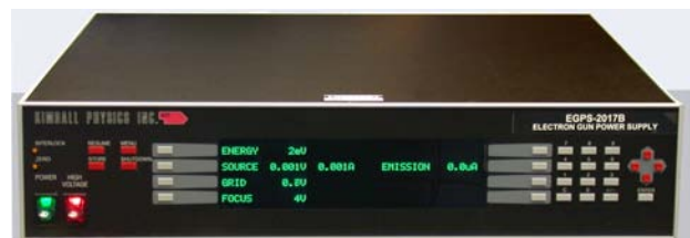
EGPS-2017 Electron Gun Power Supply with FlexPanel controller

An optional LabVIEW™ computer program designed for the EFG-7 is available for remote computer control and metering. Software is available in two types: Standard is via a simple serial connector interface. An option is using National Instrument DAQ boards and SCSI connectors on the EGPS-2017. The program provides a virtual panel of controls and real-time metering on the user's computer screen.