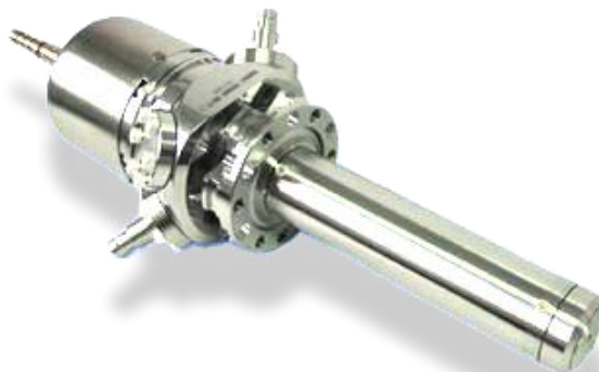
Faraday Cup FC-86