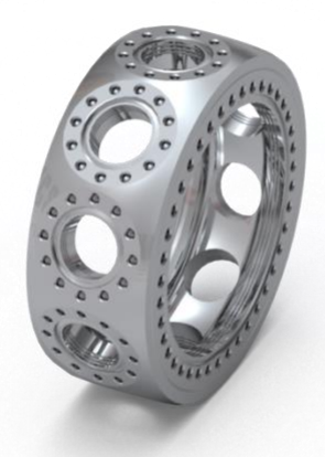
Spherical Decagon Multi-CF™ UHV Vacuum Chamber MCF600-SphDecagon-G2C10 with (2) 8.0" and (10) 2.75" CF Sealing Surface Ports