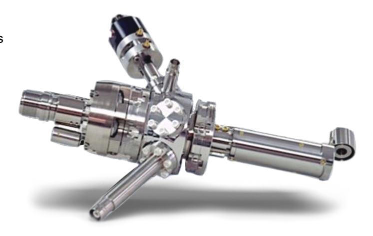
EGG-3101 Electron Gun with Optional Faraday Cup, and mounted on 2 ¾ inch Flange Multiplexer

The Kimball Physics EGG-3101 Electron Gun, with its matching EGPS-3101 Power Supply, is a multi-purpose modular Electron Gun with applications many areas. The EGG-3101 / EGPS-3101 is a complete subsystem ready to attach to a user's vacuum system and turn on.