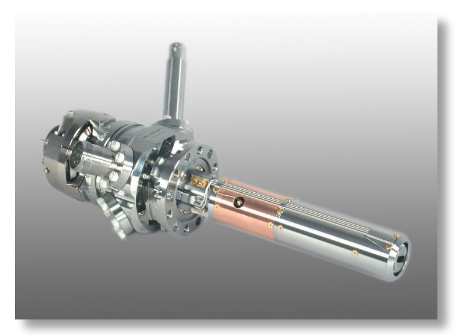
EGG-3101 Electron Gun, mounted on 2.75" inch Flange Multiplexer

An optional LabVIEW<sup>TM</sup> computer program designed for the EGG-3101 is available for remote computer control and metering. Software is available in two options: 1) using National Instrument DAQ modules and the 50-pin connector on the EGPS-3101, or 2) via a simple serial connector interface. The program provides a virtual panel of controls and real-time metering on the user's computer screen.