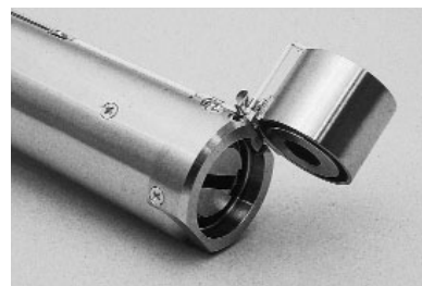
Faraday cup moved out of line for normal gun operation (0.5x)