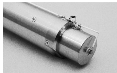
Faraday cup in line for beam current measurement (0.5x)