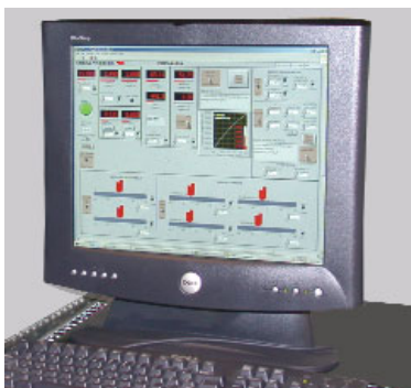
LabVIEW™ computer remote control program for EGPS-4103

The gun has a blaster element which diverts the electron beam into an in line Faraday cup. This system is used to measure the beam current in the column. The blaster provides a means of cutting off the beam while the gun is running and could also be used for pulsing.