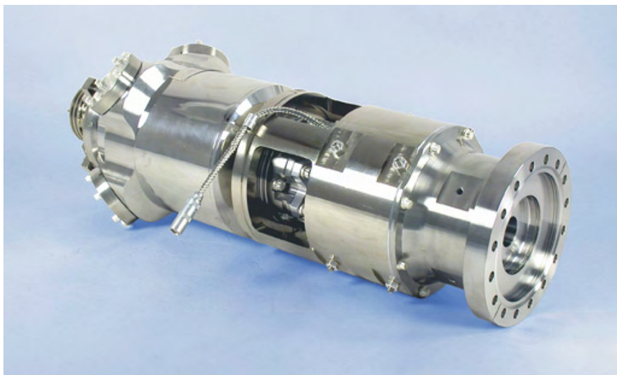
EGH-6002 Electron Gun mounted on 6 inch CFF

MEDIUM BEAM CURRENTS SMALL SPOTS MAGNETOSTATIC FOCUSING MAGNETOSTATIC DEFLECTION PULSE CAPABILITY INTERNAL ALIGNMENT WHILE OPERATING USER-REPLACEABLE FIRING UNITS 4½ OR 6 INCH CFF MOUNTING UHV TECHNOLOGY / BAKEABLE COMPUTER / REMOTE CONTROL