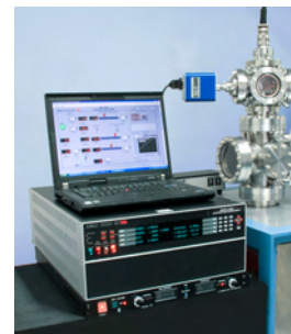
A typical lab set-up of a complete Kimball Physics high energy system with a focusable electron gun, power supplies and optional computer control system (details vary with gun model)

Standard specifications listed; Enhanced and custom specifications available.