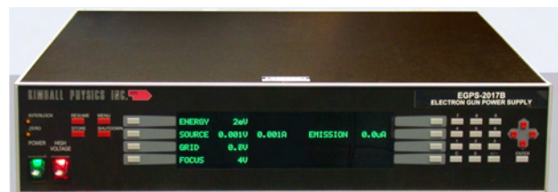
EGPS-2017 Electron Gun Power Supply with FlexPanel controller

An optional LabVIEW™ computer program designed for the EFG-7 is available for remote computer control and metering. Software is available in two types: Using National Instrument DAQ boards and SCSI connectors on the EGPS-2017, or via a simple serial connector interface. The program provides a virtual panel of controls and real-time metering on the user's computer screen.