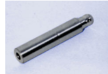
FC-66 Faraday Cup (0.5X) Unmounted with BNC and shield